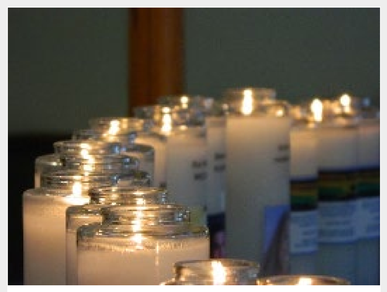
Serving the Spiritual Needs of Grieving Parents Whose Children of Any Age Have Died by Any Cause, No Matter How Long Ago

Your Emmaus Ministry Remote Retreat Guide May 30, 2020 9:30am EDT