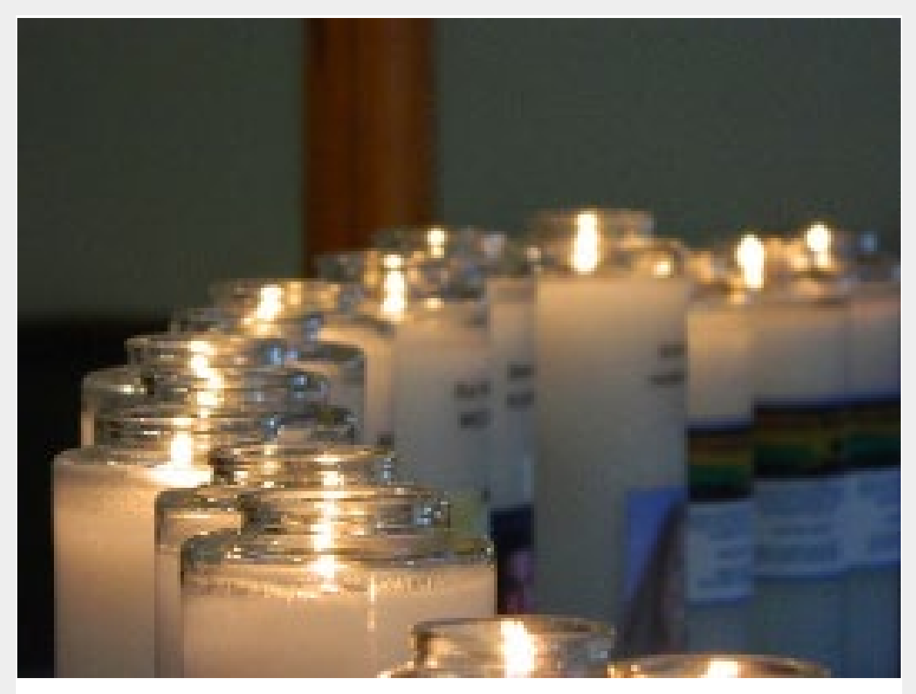
Serving the Spiritual Needs of Grieving Parents Whose Children of Any Age Have Died by Any Cause, No Matter How Long Ago

Your Emmaus Ministry Remote Retreat Guide July 4, 2020 9:30am EDT